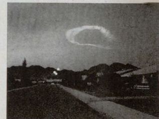
6:15 P.M., N. OF PHOENIX