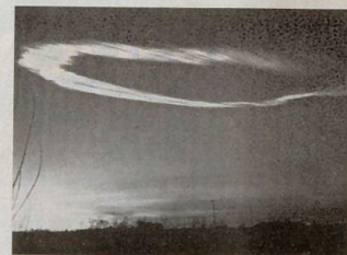
6:30 P.M., W.N.W. OF WINSLOW

When the Life Magazine color photograph is rotated 90 degrees to the right, the profile of the head of the Lord Jesus Christ is seen, with hair like white wool, reminiscent of how as he appeared to John the Revelator.