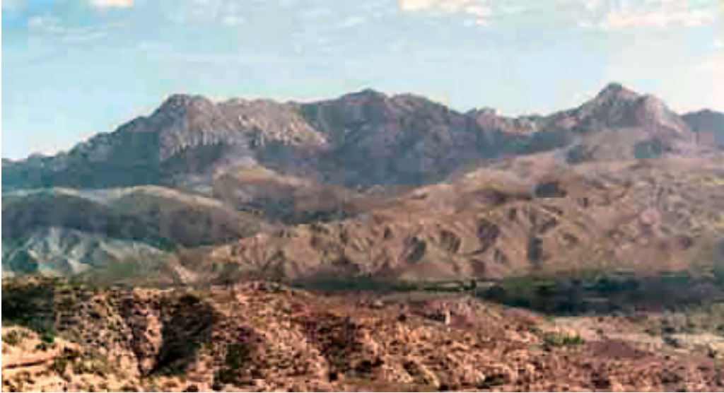
'Mesa at Sunset' by Merritt Simmons of Tucson, Arizona A view to the NE of the Sunset Mountain campsite