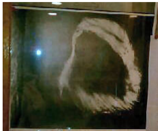
The Black and White image of the Life Magazine photo at Branham Tabernacle

This image has been scanned directly from an original copy of the Magazine