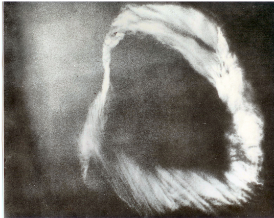
Black and White glossy Life Magazine reproduction dating from the 1970's

A second black and white glossy reproduction of the Life Magazine cloud photograph was made available by Brother Green during the early 1970's. This reproduction was of poor resolution and in addition, the cloud profile was excessively prominent but it too presented suggestions of facial features caused by areas of unexpectedly dark shading that extended across most of the image, (i.e., well beyond the width of the 'forehead'), strongly suggesting that the shading had also had been caused by problems with the reproduction processes and likely human enhancement.