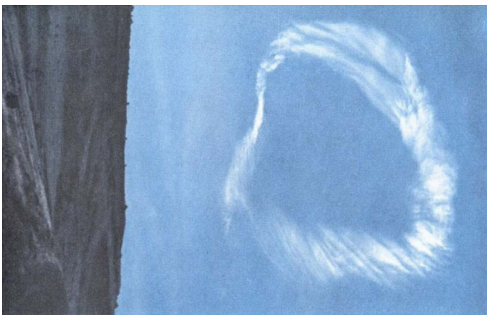
The Life Magazine photo - no facial features.

It appears likely that deficiencies in the reproduction process, as well as professional enhancement carried out at Shirley Abbott Studio, created areas of rogue shading on the replica that were not present in the original picture, and which fortuitously occurred in just the right areas to suggest two eyes and a nose before spreading further to the left to cover more than half the width of the replica (as viewed when the print is orientated to mimic the upright human head).